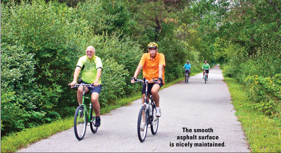
The smooth asphalt surface is nicely maintained.

resource for all to enjoy. With help from the Michigan DNR and MDOT, the first phase of the trail from Columbiaville to Otter Lake opened in 2008 with the second phase from Otter Lake to Millington opening in 2010. You will appreciate the attention to detail in the trail construction with paved gravel road crossings and well-placed benches and picnic tables. The Southern Links Trailway Management Council, made up of local municipalities and townships, has earned a reputation for keeping the trail clean and nicely maintained.